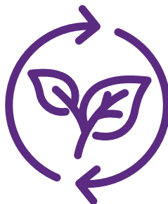
Innovative ideas and practices.