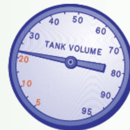
NUMBERS INDICATE THE PERCENTAGE OF GAS IN THE TANK